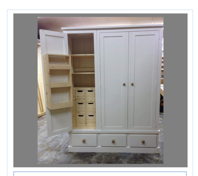
Painted food cabinets Pages 7