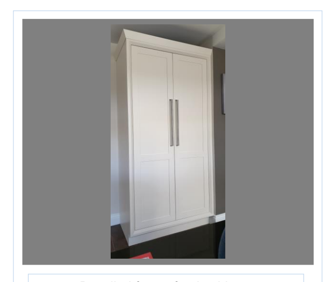
Bevelled frame food cabinets Pages 5-6